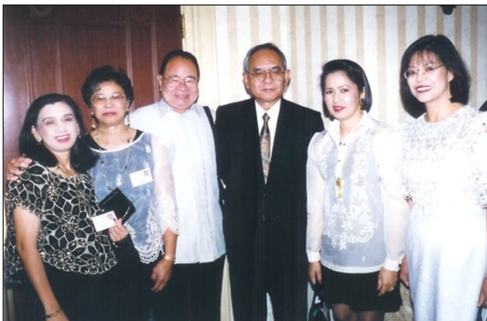
1999 UPAAC Grand Assembly & Reunion in Las Vegas with UP President Francisco Nemenzo