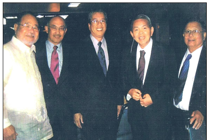
2007 UPLBAA Loyalty Day Celebration Santa Clara, CA