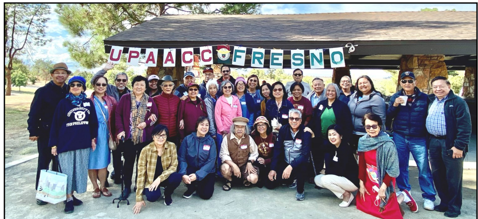
UPAACC Fall 2023 General Meeting & Picnic - Woodward Park, Fresno

Light rain and chilly weather did not dampen the spirit and enthusiasm of the more than 35 members and guests who attended the UPAACC Fall 2023 general meeting and election of officers held at Woodward Park, Fresno on September 30, 2023. After all, this was the first outdoor picnic/meeting in Fresno in over 4 years, after the COVID years. The last picnic/meeting in Fresno was held in 2019.