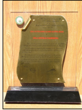
2000 UPAACC OUTSTANDING ALUMNI CHAPTER AWARD